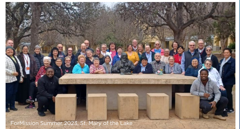
ForMission Summer 2023, St. Mary of the Lake