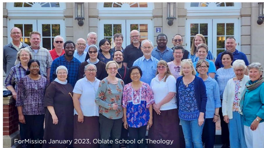
ForMission January 2023, Oblate School of Theology