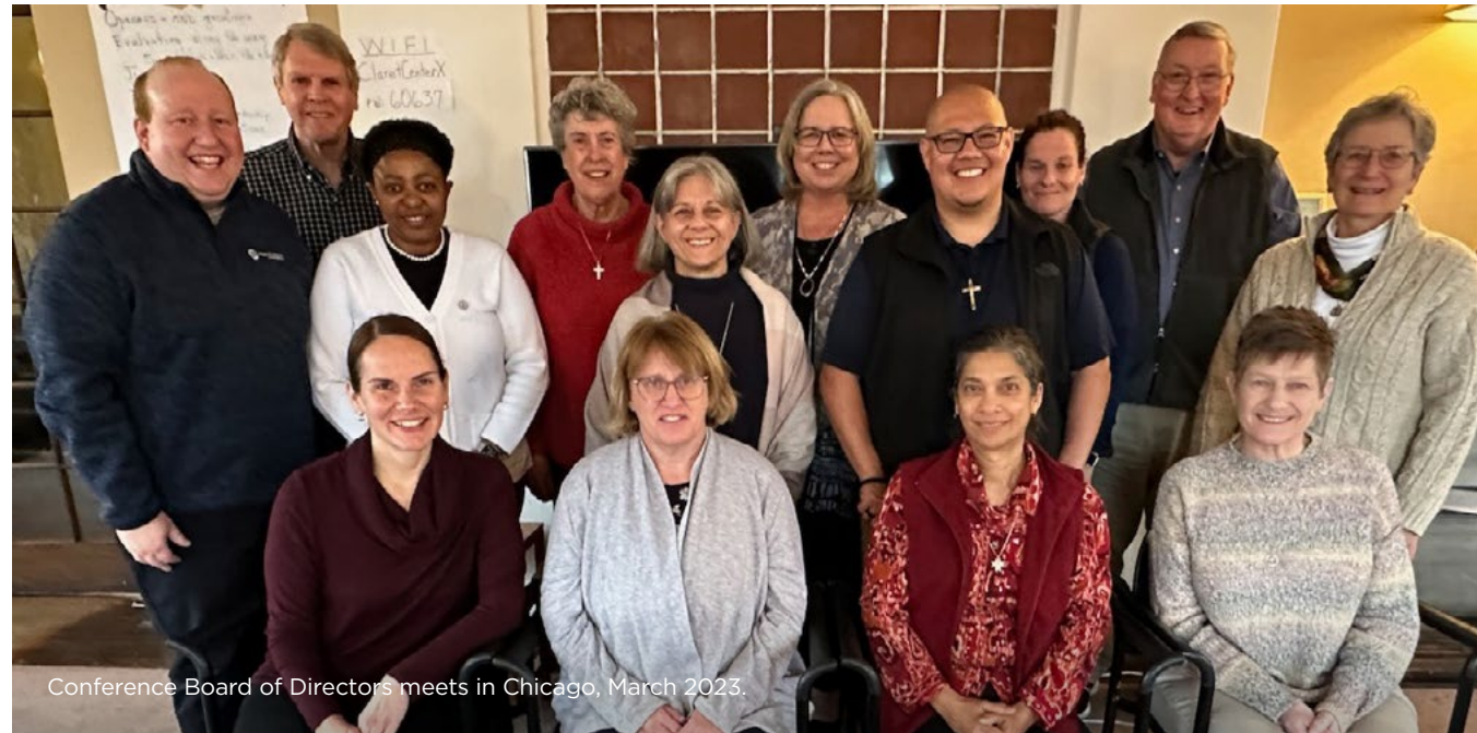
Conference Board of Directors meets in Chicago, March 2023.