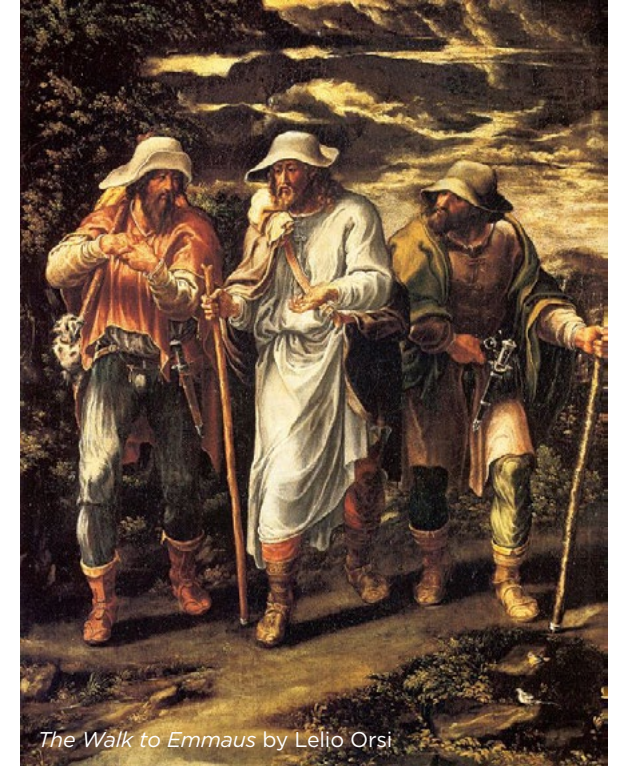
The Walk to Emmaus by Lelio Orsi