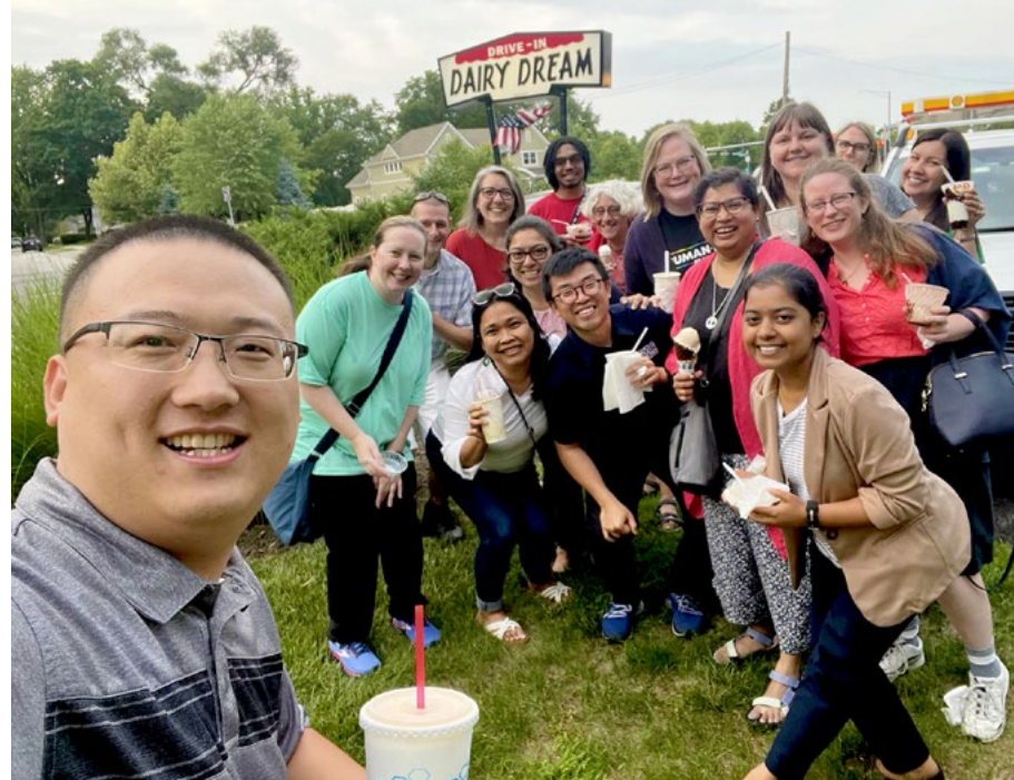
Summer fun: 2023 Life Commitment Program participants enjoying some ice cream