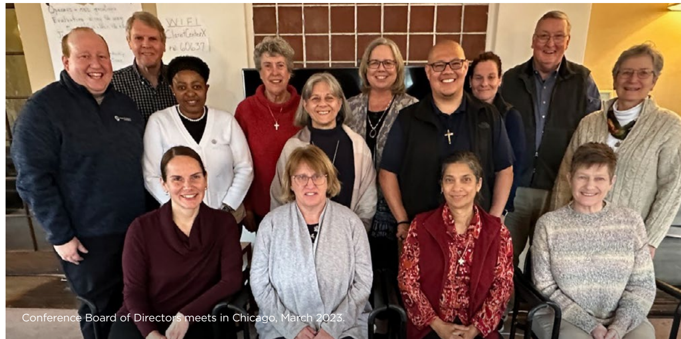
Conference Board of Directors meets in Chicago, March 2023.