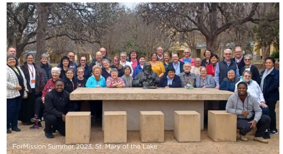
ForMission Summer 2023, St. Mary of the Lake